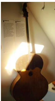
Bas: Muzej / museum - Kostanje / Köstenberg – Avstria / Austria