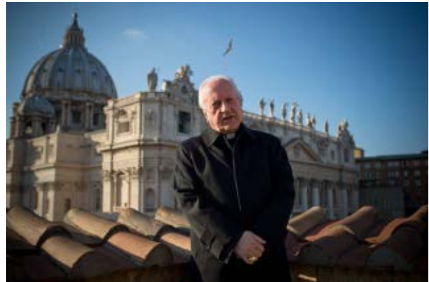
Cardinal Franc Rode

Vatikan - "Moli zame po slovensko," je novoizvoljeni papež Frančišek ob kratkem srečanju v Domu sv. Marte v Vatikanu dejal Francu Rodetu, je sporočil slovenski kardinal.