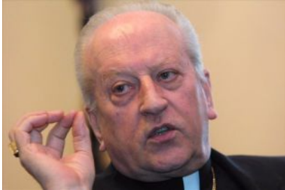
Cardinal Franc Rode