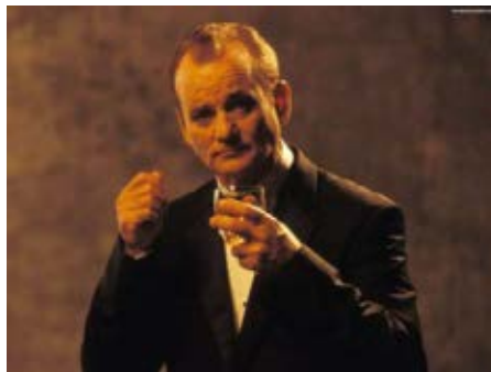
American actor Bill Murary is a financial investor in the project.