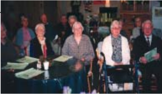
DOM POËITKA MATERE ROMANE Slovenski dom za ostarele 11-15 A'Beckett Street KEW VIC 3101