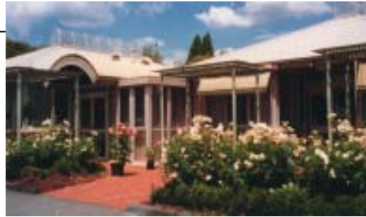
MOTHER ROMANA HOME Slovenian Hostel for the Aged Phone: 03 9853 1054 Fax: 03 9855 0811

Dom poëitka matere Romane je slovenska ustanova, ki nudi bivanje v domaem okolju ostarelim in vsem, ki potrebujejo nego. Prijazna in topla soba, domaèa hrana, vesela dru•ba, popolna zdravniška nega in celotna oskrba je samo del tega, kar boste našli v domu poëitka le 20 metrov od slovenske cerkve v Kew.